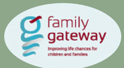
School Holiday Activities