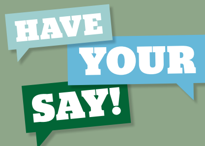
Neighbourhood Plan Consultation