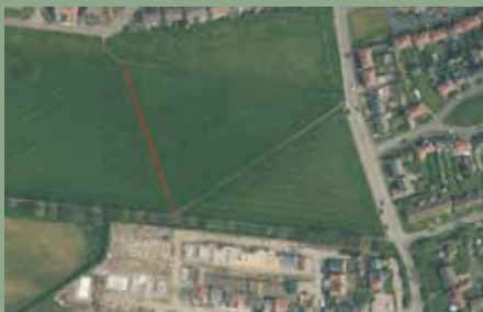
New 20 Acre Play Area