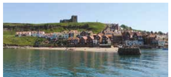
A trip to Whitby, £24.80 from Bedlington

Carlisle (Off-Peak Day Return) £25.30 from Bedlington Seaham (Off-Peak Day Return) £12.40 from Bedlington Metrocentre (Off-Peak Day Return) £8.30 from Bedlington Whitby (Off-Peak Day Return) £24.80 from Bedlington Hexham (Off-Peak Day Return) £13.20 from Bedlington Visit northumberlandline.uk to find out more.